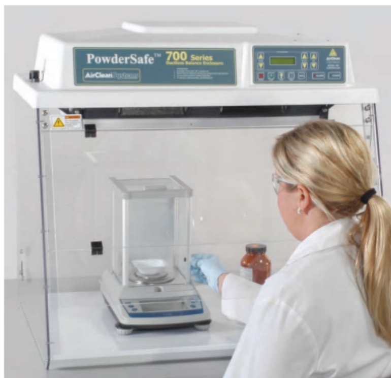
AC710C 32"-wide PowderSafe™ Type A ductless balance enclosure

PowderSafe™ Type A enclosures provide a safe and effective weighing environment for toxic compounds and/or liquid chemicals. Engineered specifically for balances, PowderSafe™ Type A enclosures protect the operator by capturing particulate in HEPA filtration without sacrificing balance stability. These compact, ductless enclosures are factory leak tested, certified and shipped fully assembled for simple installation on any countertop.