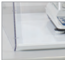
Solid 3/8" polypropylene base