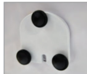
Electrical and utility cord access port