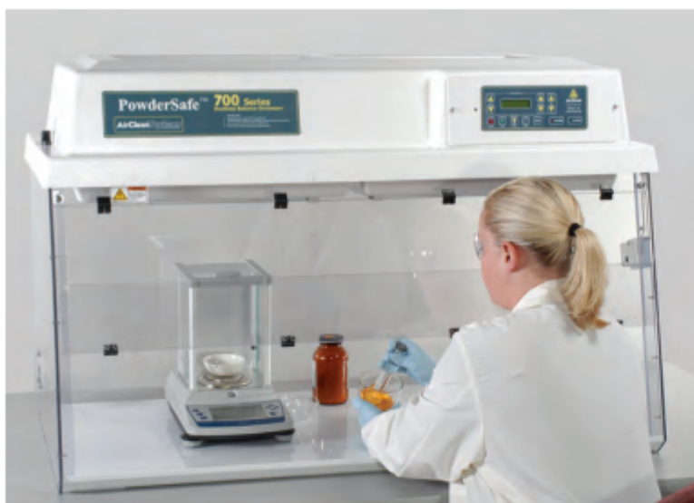
AC720C 48"-wide PowderSafe™ Type A ductless balance enclosure