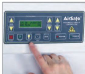
Real-time read-out of face velocity with precise airflow control and monitoring