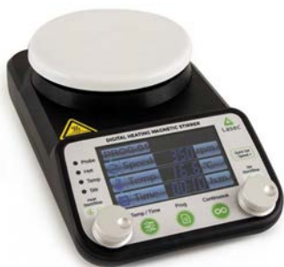
Hot Plates and Magnetic Stirrers