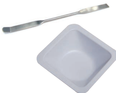
Spatulas and Weighing Boats