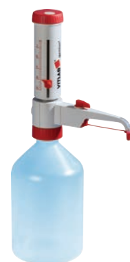
Bottle Top Dispensers