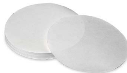
Filter Paper and Membrane Filters